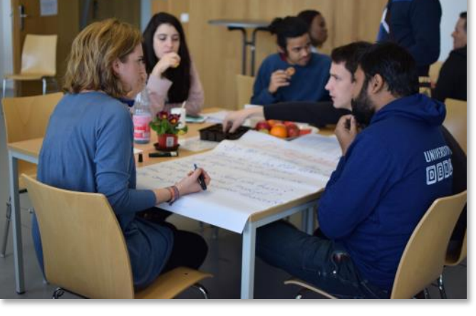
© Professorship for Adult and Continuing Education, JMU Würzburg

Including two interactive webinar-sessions on Adobe Connect