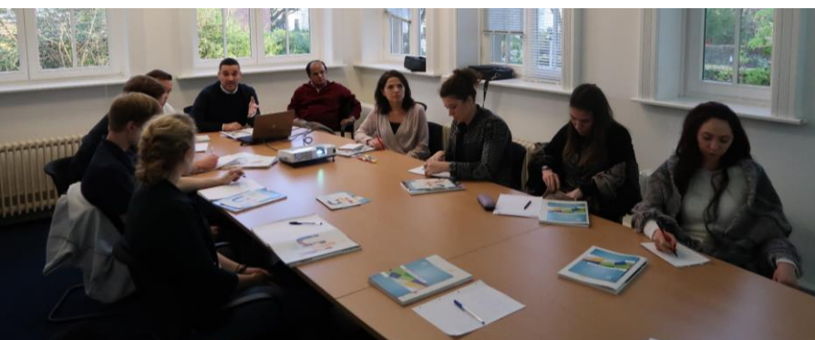
Students at UIL Hamburg

Finally, with the inter-sectoral approach, the course will broaden the understanding of the adult education profession and shed light on new roles of adult education professionals in changing practice in local specific contexts in order to respond to the new sustainable development goals.